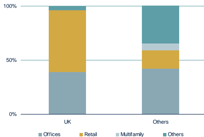
Breakdown of CMBS by sector (31 March 2011)